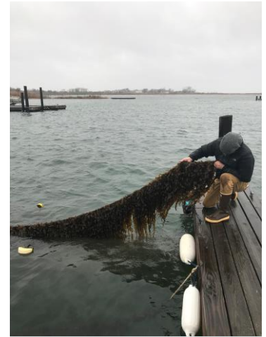
Adelphi University professor examining kelp growth as part of the Hempstead Bay research project.

For more information about the Nutrient Bioextraction Initiative, please visit https://on.ny.gov/NutrientBioextraction .