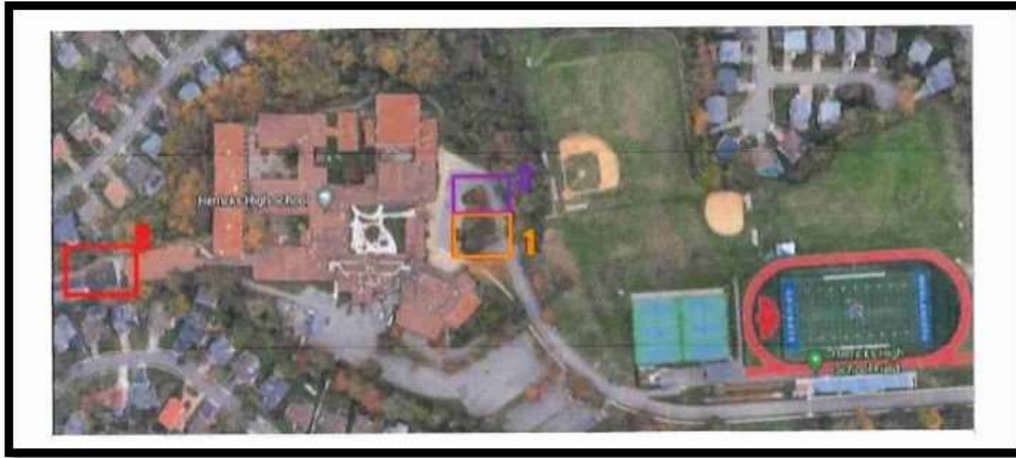
Herrick High School will be planting denitrifying flower beds on three separate areas on school grounds. The gardens will serve as a “classroom” to educate students and the community about nitrogen pollution and the benefits of denitrifying plants.