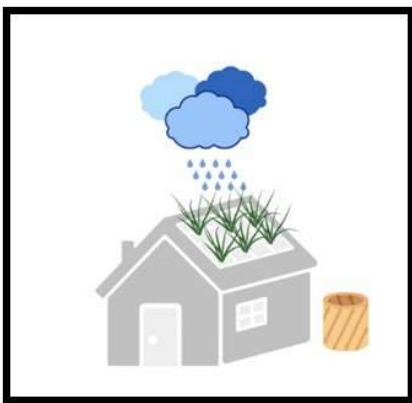
Jericho High School’s proposal included the installation of a roof garden, a rain garden, rain barrels and a composting program.