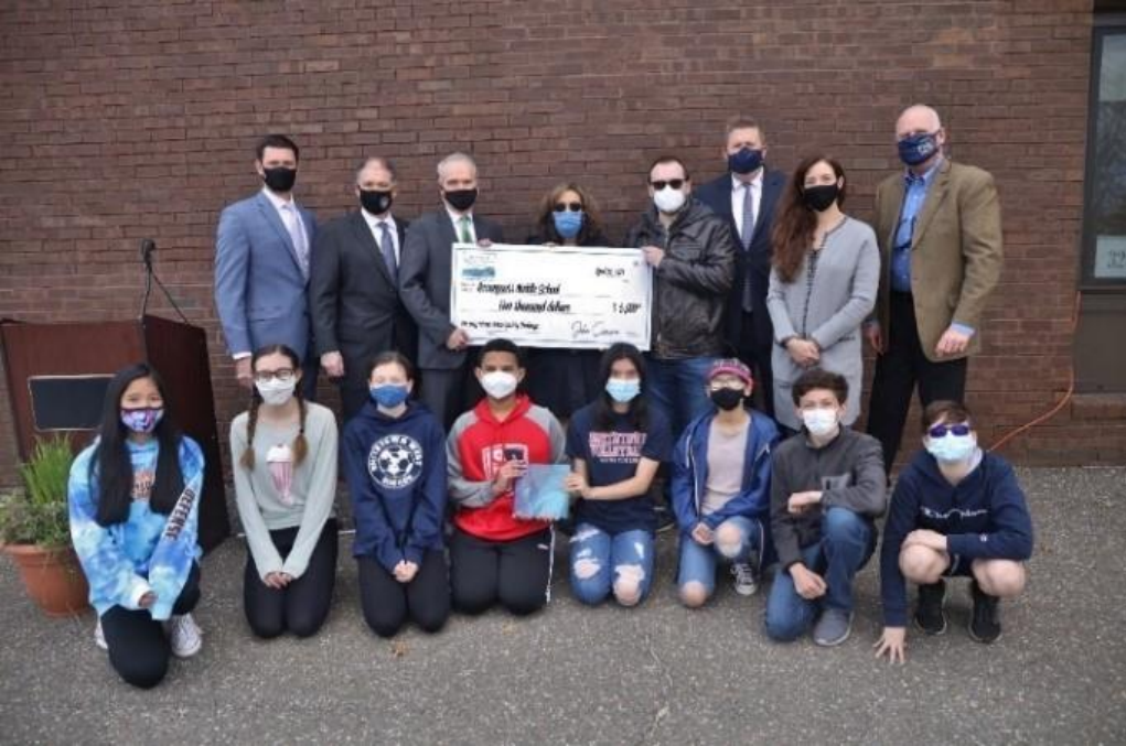
$5000 grant awarded to the Accomsett Middle School, Winner of the 2019-2020 Long Island Water Quality Challenge

At Cutchogue East Elementary School, the students collaborated to research stormwater treatments to minimize pollution into the Peconic Bays. They created a design and plan for implementation for a bio-retention area on the campus, which will use soil, plants and microbes to treat stormwater before it is infiltrated or discharged.