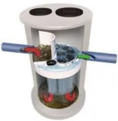
New Hyde Park Memorial High School proposal: An Enhanced Stormwater Treatment System at New Hyde Park Memorial High School. This winning plan directs rainwater to rain barrels with a Jellyfish