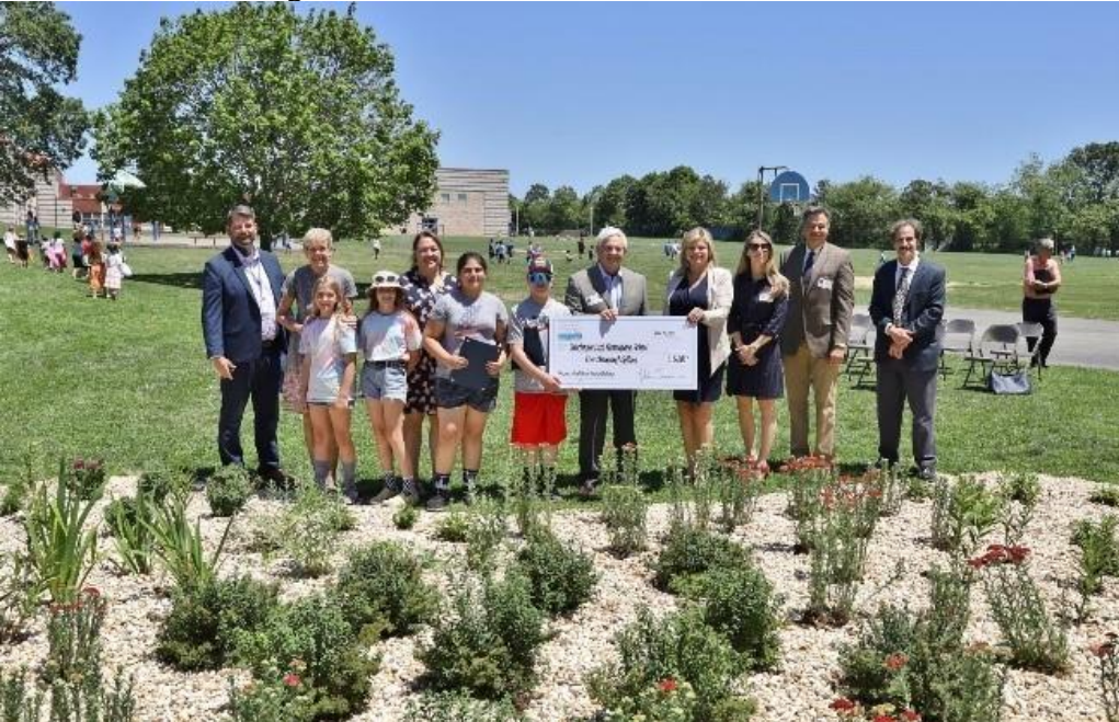
$5000 grant awarded to the Cutchogue East Elementary School–Winner of the 2019-2020 Long Island Water Quality Challenge.

At Cutchogue East Elementary School, the students collaborated to research stormwater treatments to minimize pollution into the Peconic Bays. They created a design and plan for implementation for a bio-retention area on the campus, which will use soil, plants and microbes to treat stormwater before it is infiltrated or discharged.