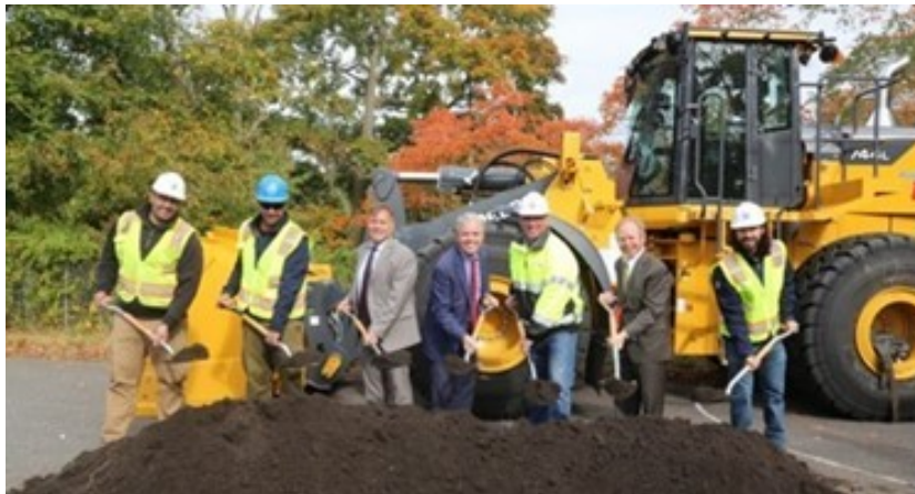
Suffolk County officials and construction leaders at the groundbreaking ceremony for the Carlls River Watershed sewer expansion project.

Construction is already underway in the Carlls River and Forge River Watershed. Both projects will use low-pressure sewer systems, that include pumps buried in front of each house; a method that is cost effective and causes less construction disruption. The Carlls River project is anticipated to be completed in 2024, with Forge River to follow in 2026. In the Village of Patchogue, contracts have recently been awarded and groundbreaking is expected in late fall or early winter. In Oakdale construction is expected to be complete in 2024.