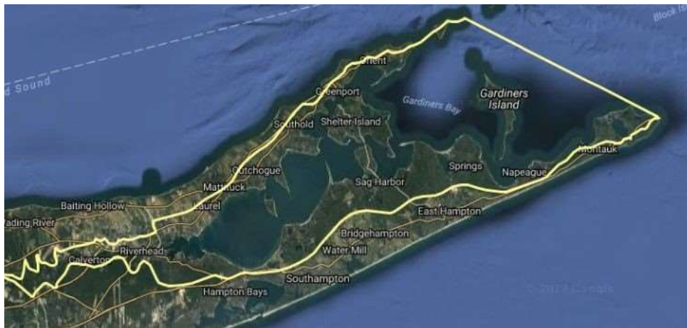
Peconic Estuary.

Concurrently, LINAP is working with the USGS to expand this model to the rest of Long Island. This will provide a wealth of information that will help guide local, state and regional management actions.