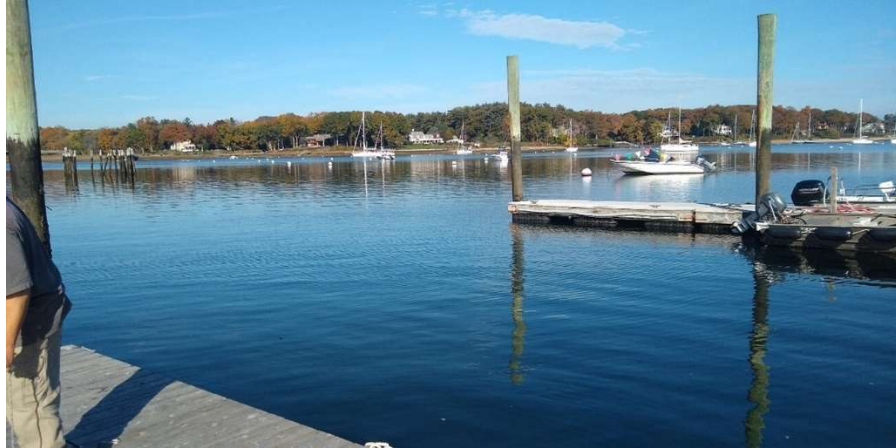
Goldstar Beach, Huntington Harbor, is one of two grow out locations where ribbed mussels and water quality data are monitored, October 2022.